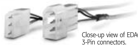
Close-up view of EDAC 3-Pin connectors.