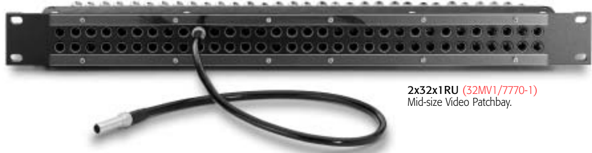
2x32x1RU (32MV1/7770-1) Mid-size Video Patchbay.