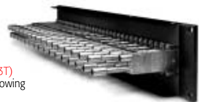
Rear view. (32MV2/MVJ-3T) Mid-size Video Patchbay showing staggered BNC termination.