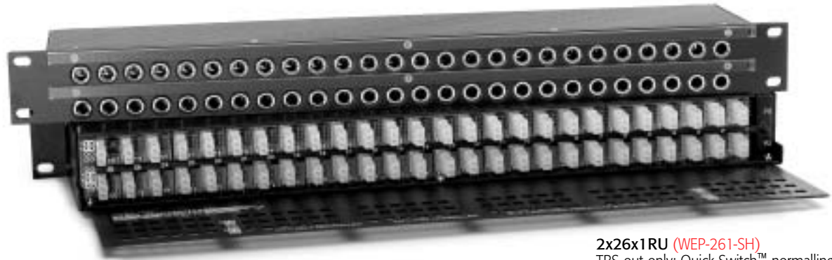
2x26x1RU (WEP-261-SH) TRS out only; Quick-Switch™ normalling. For use with analog or digital.