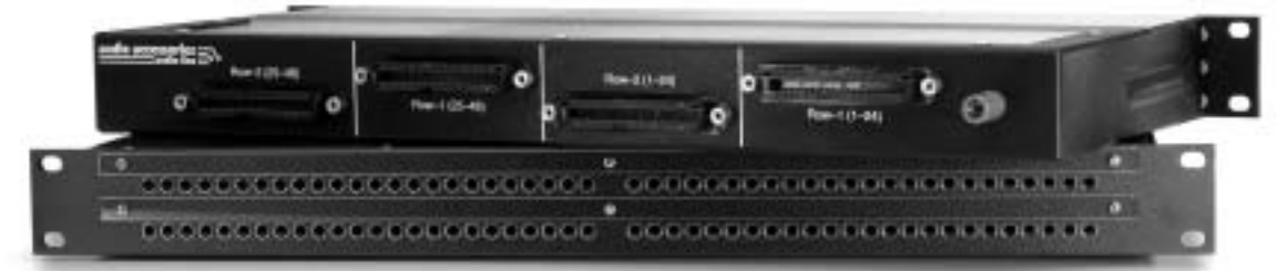
2x48x1RU MINI (1718W-HN-48-1RU)