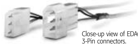
Close-up view of EDAC 3-Pin connectors.