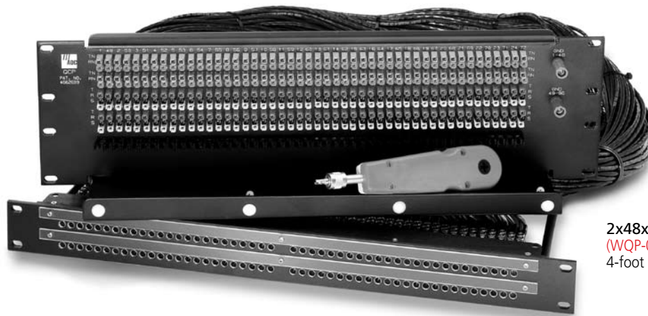
2x48x1RU (WQP-05-P-H4-48-N-1) 4-foot harness