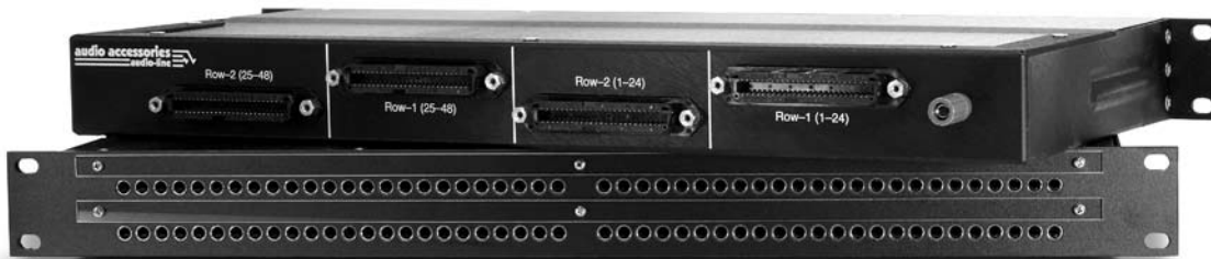
2x48x1RU MINI (1718W-HN-48-1RU)