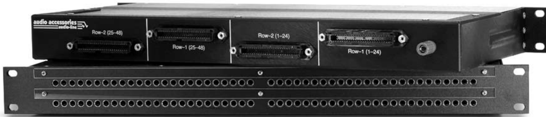
2x48x1RU MINI (1718W-HN-48-1RU)