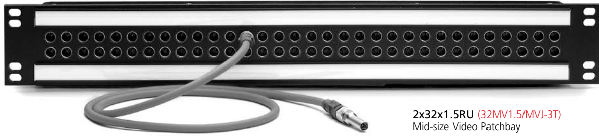
2x32x1.5RU (32MV1.5/MVJ-3T) Mid-size Video Patchbay