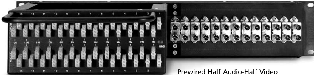
Prewired Half Audio-Half Video 13 video, 26 audio (WSP-26AV2)